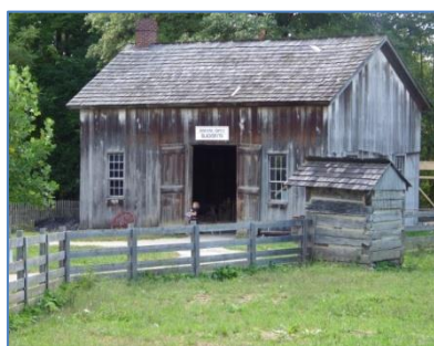
The blacksmiths shop or "Smiddy" .....

Saturday saw us literally cross the road from our hotel to the Eiteljorg Museum of American Indians and Western Art ( www.eiteljorg.org ) where we were enthralled with both the exhibits and the quite fantastic paintings, some so vivid and detailed that you would be excused for thinking that they were photographs! A most enjoyable and absorbing morning passed whereby we gleaned much