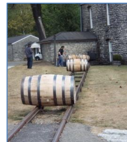
Barrels of matured bourbon are rolled down to the bottling room

( www.heirloommidway.com ) was well patronised and it was easy to see why – well prepared meals, nicely presented and boy, were they tasty! Suitably “recharged” we were on the move again, this time to visit the famed Woodford Reserve Distillery ( www.woodfordreserve.com ), near Versailles (although pronounced “Versails” down these here parts!). The tour