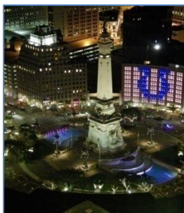
Indy night scene - the elaborate "Monument Circle" as seen from the Skyline Club

For some strange reason, it would have appeared that the Scots reputation for “the appreciation of wine and spirits” had some influence on our hosts for next on the agenda was a visit to a local craft brewery! The St Joseph Brewery ( www.saintjoseph.beer ) had taken over a disused building in