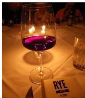
A rather pleasant 2011 Napa Valley Cabernet Sauvignon at the Rye

After trying a couple of their brandies, we topped off the degustation with a sampling of Hubers Autumn Gold, an enchanting ice wine with smooth honey, apricot and orange blossom flavours to tantalise both nose and palate. What a finish! After a much needed lunch which was enjoyed at the Winery, it was realised that much as we had savoured (literally!) our experience at Hubers, it had taken a tad longer than anticipated with the result that the