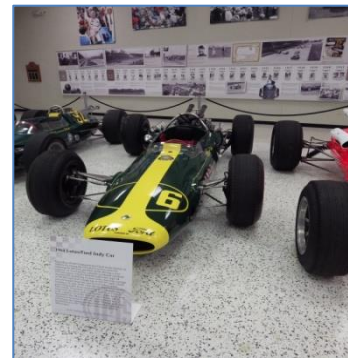
1963 Indy 500 second placed Lotus 38 driven by Jim Clark

With all the different cars on display we could have spent hours there. What an enjoyable afternoon! Sunday evening would see us attend the Goustevin Indianapolis Chapitre and Gala Dinner which, of course, was the principal reason for our trip to America. For full details of what was an excellent evening, please go to the separate report " Indianapolis Chapitre & Gala Dinner ".