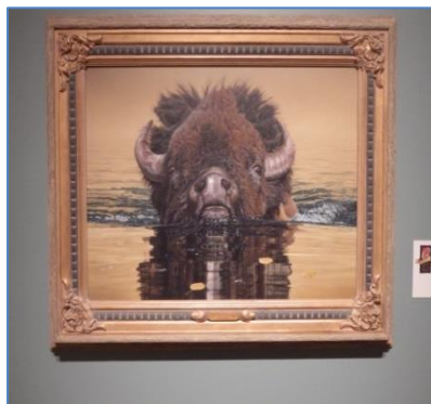
“Bison swimming a river” - this painting on sale at $32,000