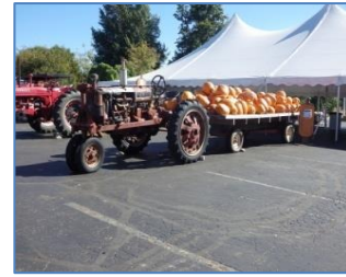
Pumpkins galore at Hubers

Our final night in Indy would take in dinner at the Skyline Club, a most distinguished private business club atop The One America Building, (Indy's highest), sitting on the 36 th floor overlooking the city and the giant Lucas Oil Stadium where the Indianapolis Colts were playing the New York Jets at football.....sadly they got trounced – from the Club we could just about see the action on the large screen inside the stadium, thanks to the open roof. The views from the restaurant overlooking Indianapolis, particularly at night are most striking. A most pleasant evening in congenial company, an imaginative menu with very agreeable wines – unfortunately the writers notes on menu and wines has got misplaced....hence the lack of detail. Back at the hotel the idea of an “early” night before our departure for Kentucky seemed most sensible.