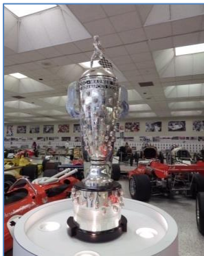
The sterling silver Borg Warner Trophy to the Indy 500 winner -now worth over $1m!!