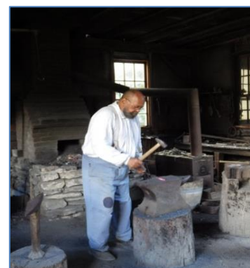
.....where the Blacksmith works on the anvil

information (for example, the distinct difference between a tipi and a wigwam) on the myriad of American tribes, their cultures and existence. Some of the modern art was of less interest to the writer, being somewhat impressionistic, but of much interest were authentic clothing, crafted tools and artefacts made by the tribes of yesteryear. Lunch was then enjoyed at the Museum prior to us motoring out to Conner Prairie just to the north of Indianapolis. This place, certainly from their website, ( www.connerprairie.org )