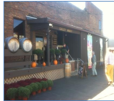
The Easley Winery in downtown Indianapolis