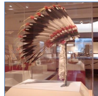
American tribal chief's traditional head-dress

Saturday saw us literally cross the road from our hotel to the Eiteljorg Museum of American Indians and Western Art ( www.eiteljorg.org ) where we were enthralled with both the exhibits and the quite fantastic paintings, some so vivid and detailed that you would be excused for thinking that they were photographs! A most enjoyable and absorbing morning passed whereby we gleaned much