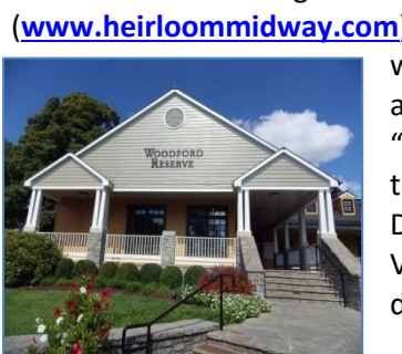
The Woodford Reserve Distillery Tasting Room & Reception Centre

procedures involved. We then moved up to the stables which housed a number of young horses, well looked after and in top condition – from these stables they have ready access to the tracks and training facilities and they are carefully trained up until ready for their competitive outings. With the cost of thoroughbred stallions and mares running into $millions, this is one serious establishment where a single failure to produce a winning horse can easily damage their reputation. No pressure then! All too soon we were on our way for lunch but with the level of interest shown by the party, much more time could have been spent at the farm with Michael answering countless questions from the group. Lunch would be enjoyed in the pleasant township of Midway, an old railway town (midway, unsurprisingly!) between Frankfort and Lexington with the rail tracks literally running alongside the main street in the centre of town, active tracks I may add, as a freight train trundled through during lunch. No casual wandering around sounds like a good maxim! The Heirloom Restaurant